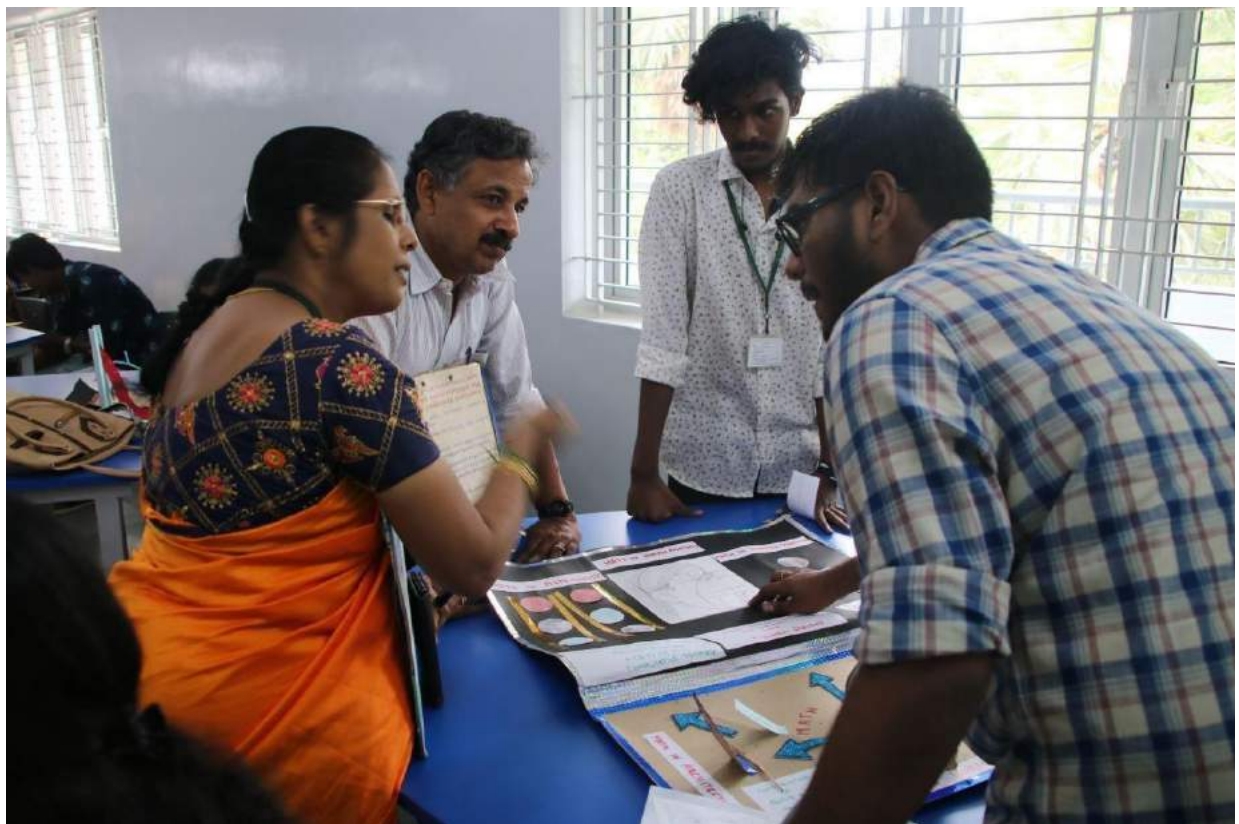
A doubt clearing session during the Seminar