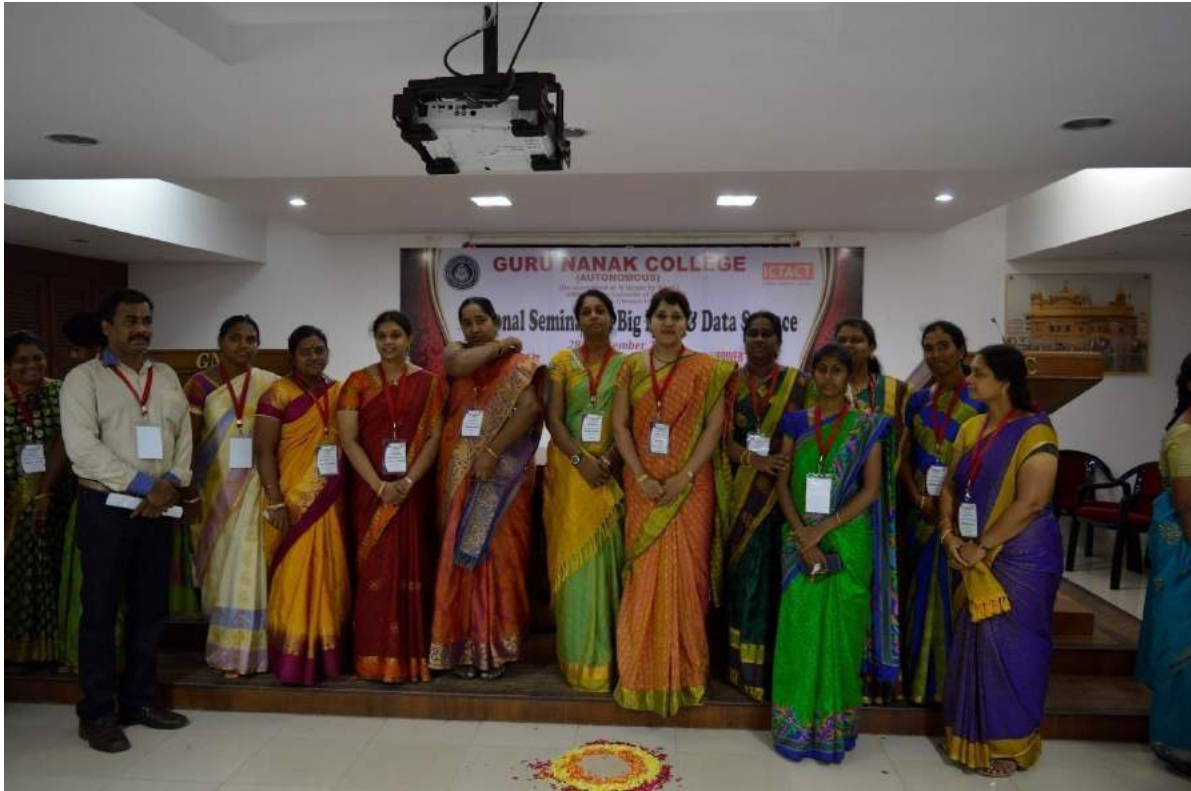
Members of organizing Committee of the National Seminar on Big Data & Data Science.