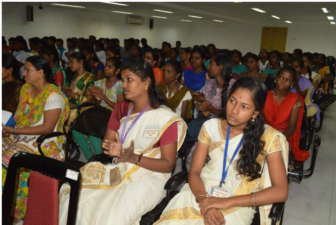
Student Participants of the National Seminar on Innovative Technologies in Insect Science”.