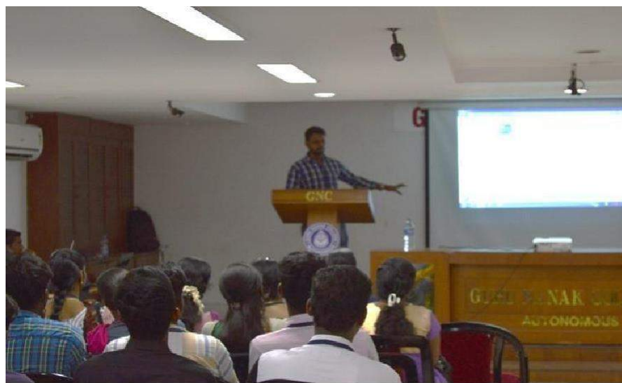
Resource is presenting on 3D Animation