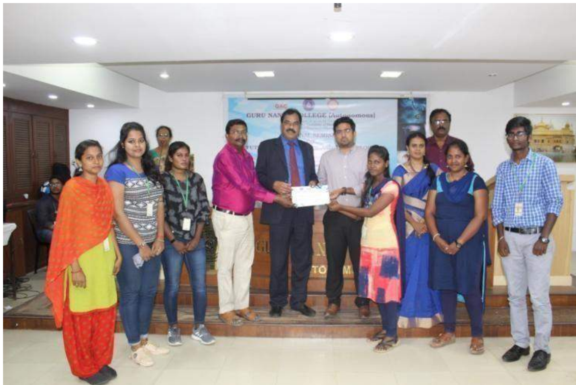
Distribution of Certificates to the participants