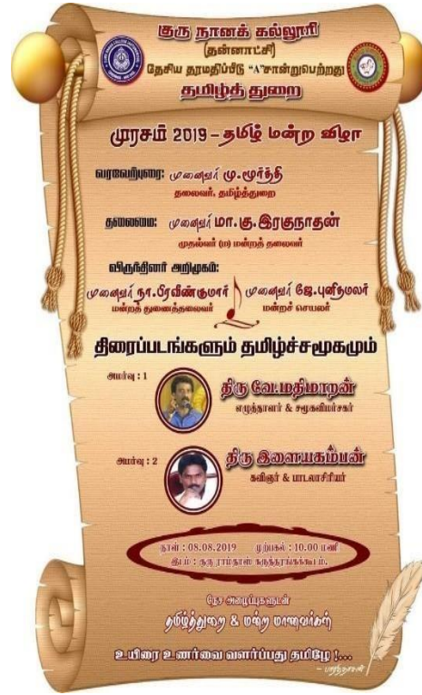
Murasam 2019 - Mandra Vizha